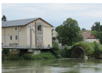
The riverside Au Moulin des Écorces is ideally located for exploring Dole

at the foot of a château with 45 individually decorated bedrooms.