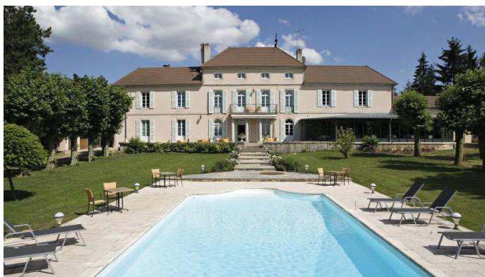
Sample award-winning food and relax by the elegant outdoor pool at Château Mont Joly