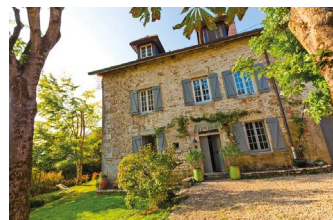
Set in atmospheric gardens, À l'Ombre du Château has five stylish bedrooms

A stylish 18th-century property with five charming bedrooms in Nans-sous-