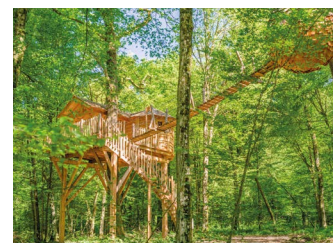
Sleep among the treetops and get back to nature in these cabins in the region