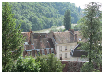
Former monastery Hôtel Le Sauvage has breathtaking views over Besançon